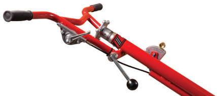
Fine pitch handles use a twist action to control blade pitch from flat to 28° and anything in between.