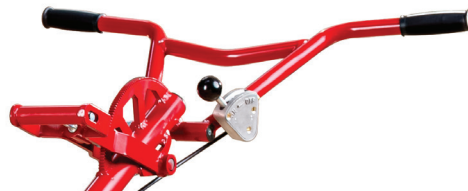
Rapid pitch handles use a ratcheting action to provide easy adjustment with the push or pull of a lever.